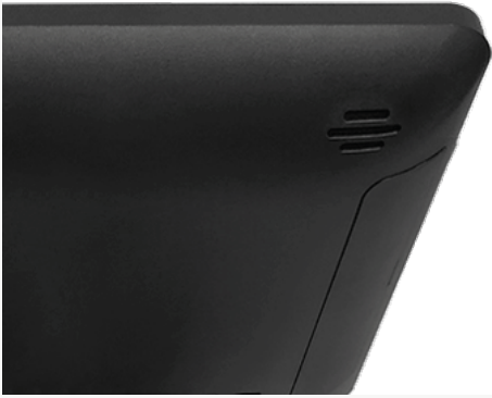
SPEAKERS 2 X 2W