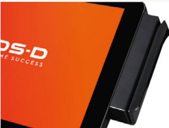
MAGNETIC STRIPE READER